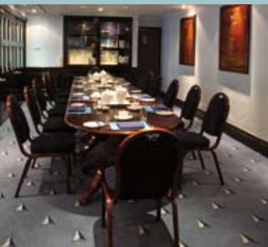
CLAUD WORTH ROOM

For presentations, meetings and fine dining; we offer style, comfort and spectacular views of the River Thames