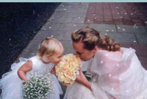
BRIDE & FLOWER GIRL